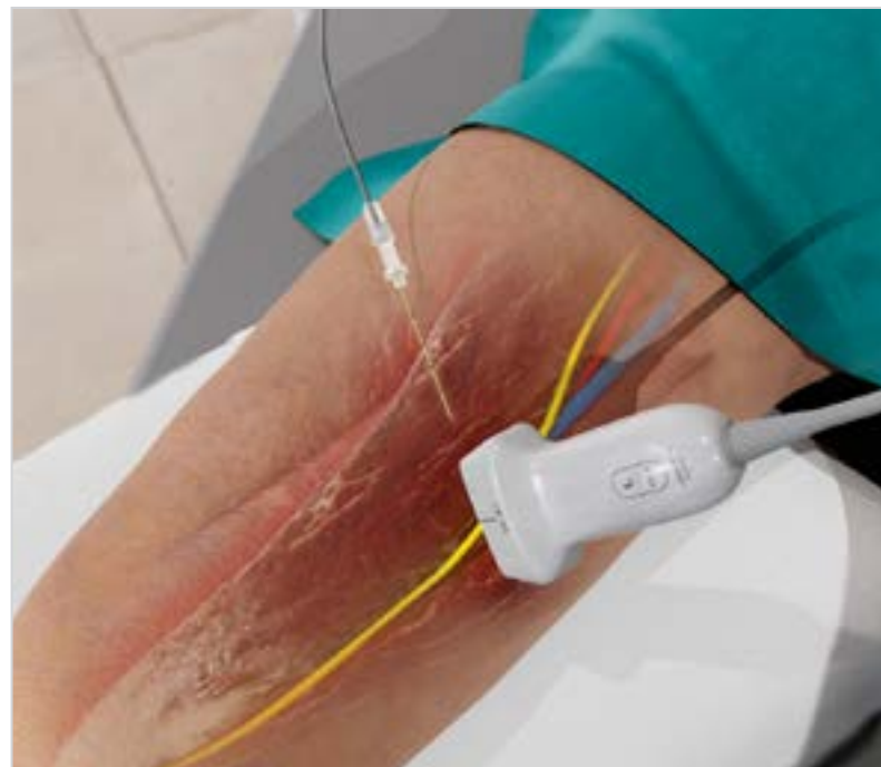
FIG. 1: Supine, Knee Position and Transducer Location