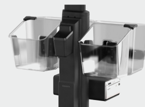
Optional large storage bin

Choose different sized storage bins and left or right-sided gel/wipes holder configurations to best suit your workflow needs.